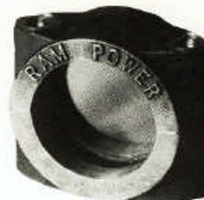
CODE No. 50-501